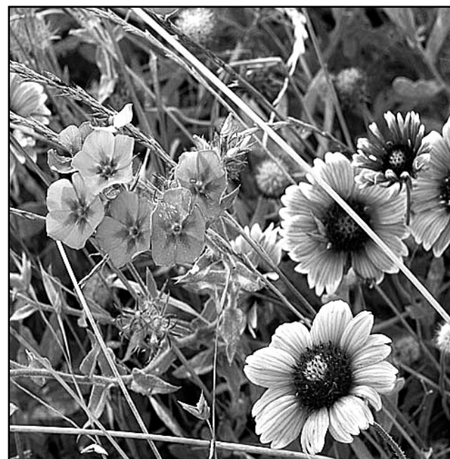
Contest winning photos from previous years.