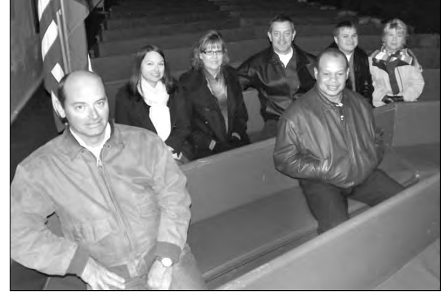
"The Back Pew" A group of LWC participants sit on a bench in Independence Baptist Church. The pew marked with a flag is where Sam Houston sat and his name is still visible where he carved it in the wood.