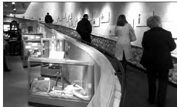
"Going Up" LWC participants make their way to the second floor of the star-shaped museum to view exhibits of the social and cultural heritage of the unique people who came together to create the Republic of Texas.