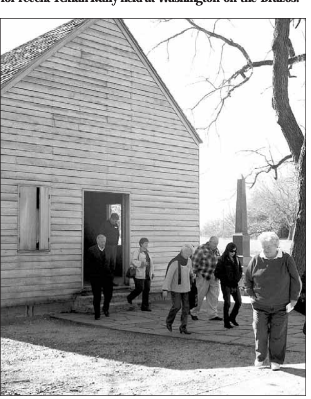
The 11th Annual Texas Independence Trail Region's Texian Rally workshop was held at Washington-on-the-Brazos State Historic Site. Attendees were treated to special tours of Independence Hall, behind-the-scenes tour of Star of the Republic Museum and Barrington Living History Farm.