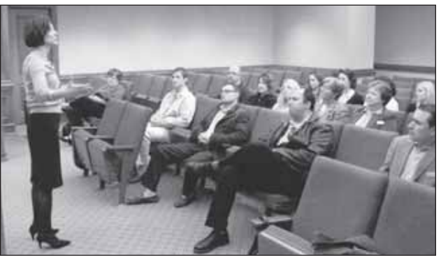
Legislature Regular Session.