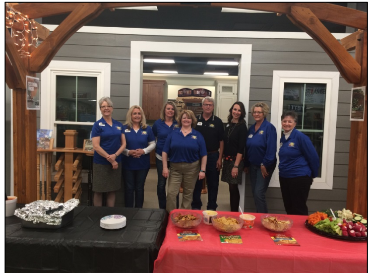
Business After Hours