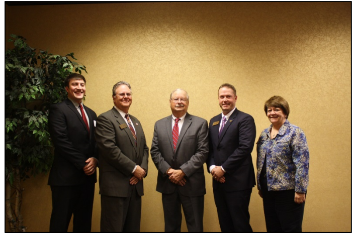
State of the Valley

Please provide a camera ready ad or the Chamber can design your ad for a $50 charge. The acceptable format for a camera ready ad is Adobe PDF or Microsoft Word. All photos need to have minimum 300 dpi and must be CMYK color. If you wish the Chamber to design your ad, please submit the content, logos and any pictures to office@scottsbluffgering.net . A PDF email proof will be provided to you. If you have any questions please contact the Chamber at 308-632-2133 or office@scottsbluffgering.net .