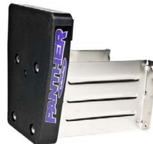
Bracket setback length including Poly board is 10.125"