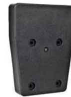
Poly board measures approx. 8" wide x 10" long Part number 99-55650

Always remove your motor from bracket when trailering. Failure to do so may result in damage to Boat, Motor or Bracket.