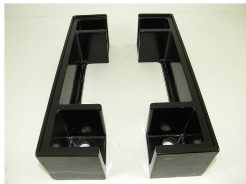
This side to motor