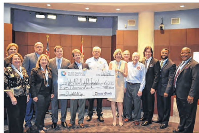
The race benefited the West Palm Beach Police Foundation's 'Shop with a Cop' program, which provides funds for children to shop with volunteer police officers during the December holidays to purchase gifts for their families.