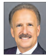
Greg Leach Hospice of Palm Beach County Foundation