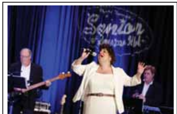
Orland Township seniors sang their way to the top at last year's Senior American Idol.

residents ($22) are now on sale. Pick yours up at the Township today.