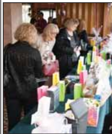
2013 OWN Luncheon attendees check out the raffle prizes at the 2013 event.

Planning has begun for the 2014 OWN Luncheon! Our annual luncheon draws almost 200 professional women and is a guaranteed good time so mark your calendar, call your girlfriends and save the date.