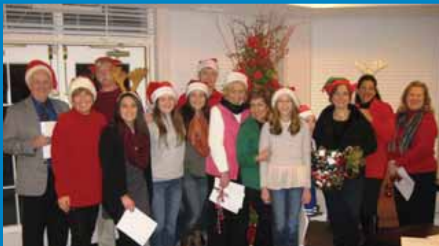
The Ambassadors Club got together to sing Christmas Carols at Peace Village and Alvernia Manor during the holiday season.