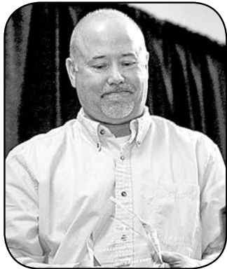
Mitchell Skating and Hockey Association's Twice the Ice Committee

December 1st, has already made a significant improvement to the available recreational and sports facilities in Mitchell and will significantly increase tourism in the Mitchell area. Along with being the home to the Mitchell Marlins, the second sheet of ice will bring in six additional tournaments, several invitational round-robin games, and Mitchell Blades, a figure skating group. The growth is just beginning.