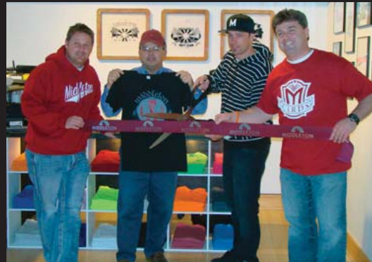
Think It Then Ink It Ribbon Cutting