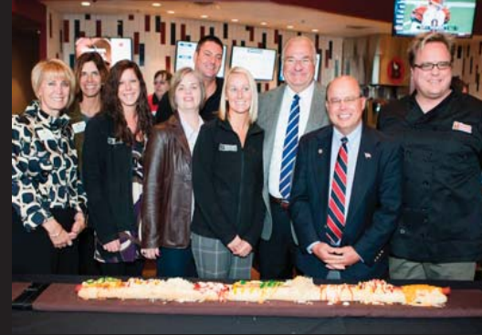
Bison Jack's Ribbon Cutting