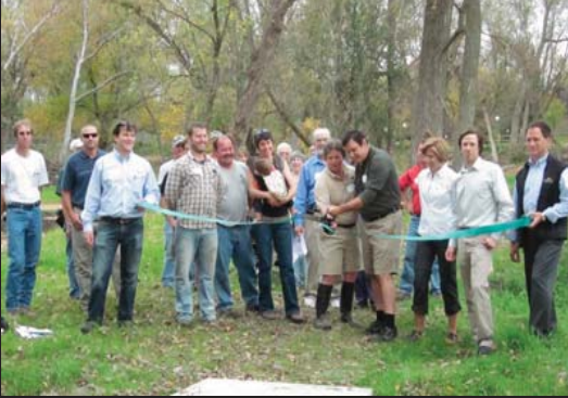
Middleton Pike Hatchery Ribbon Cutting