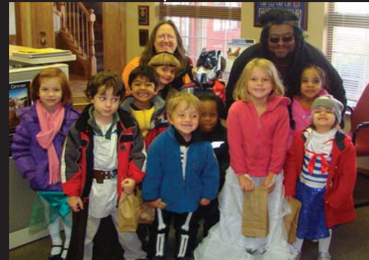
Little Red Preschool Spooks the Chamber