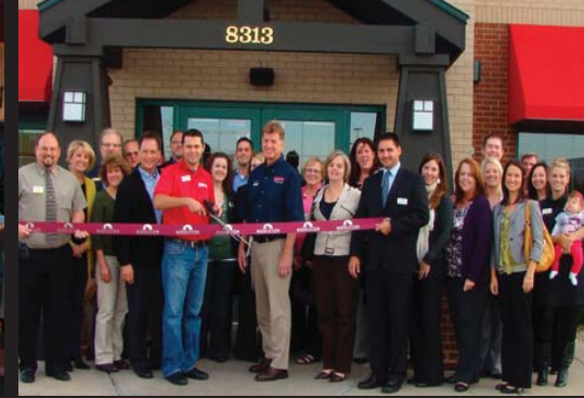
Monk's Bar & Grill Ribbon Cutting