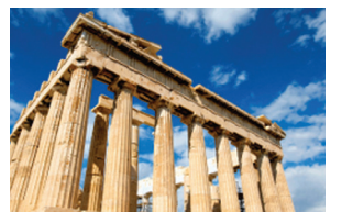
Greece & Mediterranean $4,099 per person

Limited space still available. For more information available at LynchburgRegion.org or contact Denise Rowland at 434.845.5966.