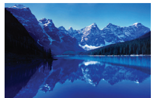
Canadian Rockies $3,099 per person

The rich tradition for the creation and appreciation of art and culture continues today. Many artists from around the world are drawn to the alluring landscapes, and arts and culture are celebrated in the galleries, cultural centers, historic sites, museums of Banff & Lake Louise and more.