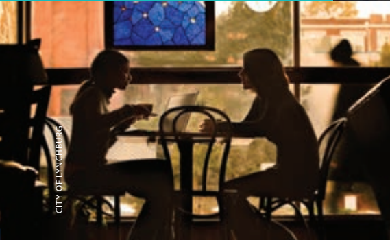
CITY OF LYNCHBURG

Milken Institute -200 Small Metros (2013)