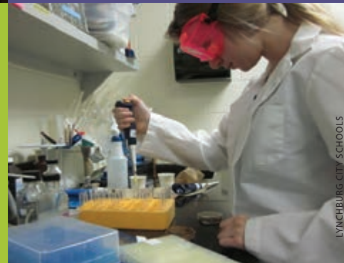
LYNCHBURG CITY SCHOOLS