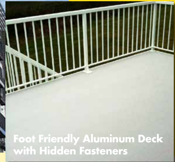
Foot Friendly Aluminum Deck with Hidden Fasteners

Increase the value of your project while saving time & money by avoiding the hassle of maintenance, repair and replacement of a conventional deck.