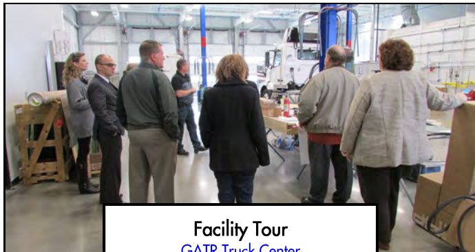
Facility Tour GATR Truck Center