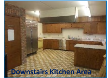
Downstairs Kitchen Area