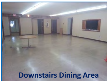
Downstairs Dining Area