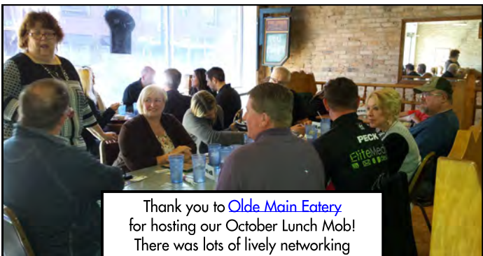
Thank you to Olde Main Eatery for hosting our October Lunch Mob! There was lots of lively networking while we all enjoyed a great lunch.