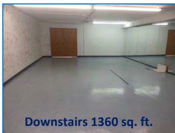
Downstairs 1360 sq. ft.