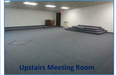
Upstairs Meeting Room