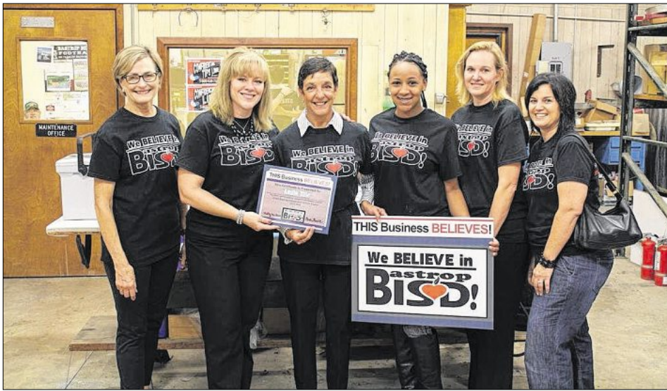
BISD Maintenance Department sponsored by Austin Title