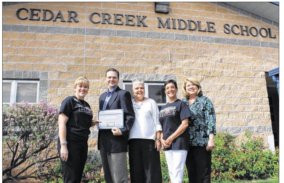
Cedar Creek Middle School sponsored by Classic Bank