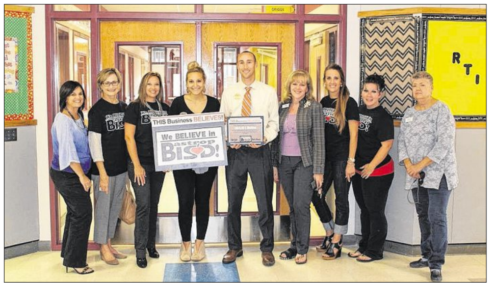
Bastrop Intermediate School sponsored by Chick-fil-A