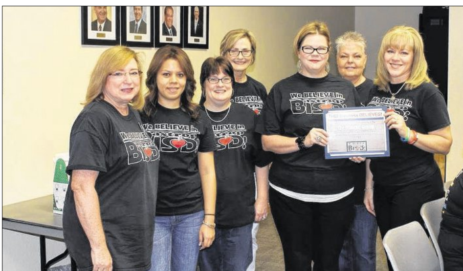
BISD Service Center sponsored by the Nitsche Group