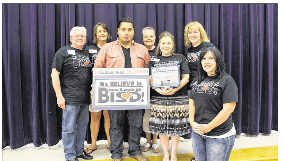
Red Rock Elementary sponsored by the Bastrop Advertiser