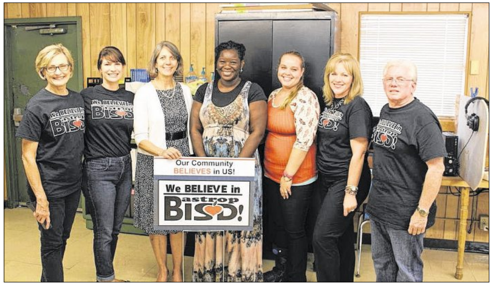
Bastrop County Juvenile Justice Center sponsored by Ladd's Coin & Jewelry