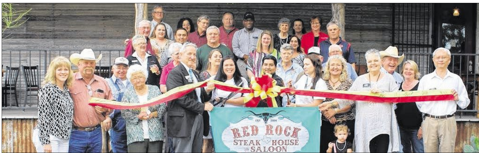
Red Rock Steakhouse celebrated its Grand Opening with a joint ribbon-cutting between the Bastrop and Lockhart Chambers on May 15th. It was a unique opportunity for two chambers from two cities and two counties to come together and meet in Red Rock to celebrate the opening of the steakhouse there.