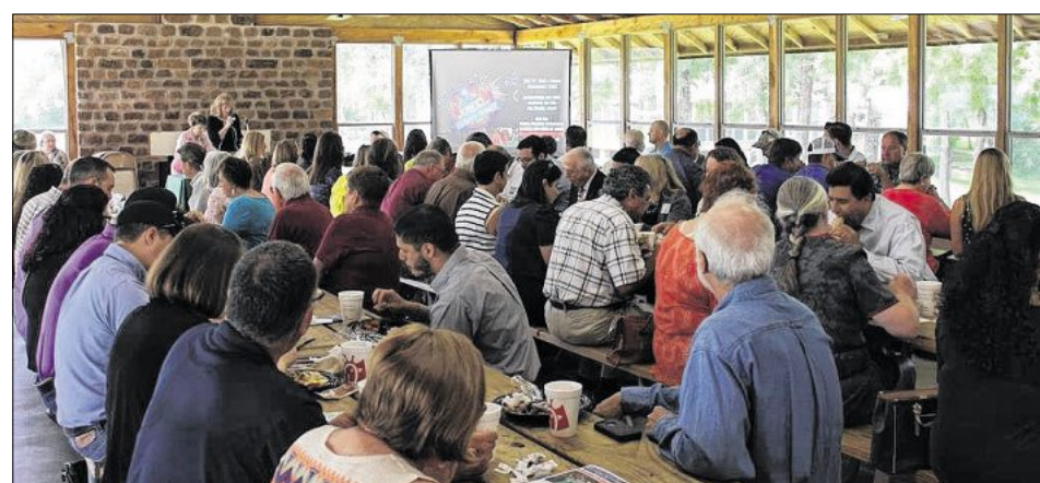
May Luncheon: Attendees at the May Bastrop Chamber of Commerce Luncheon listened to a program on fraud in business.