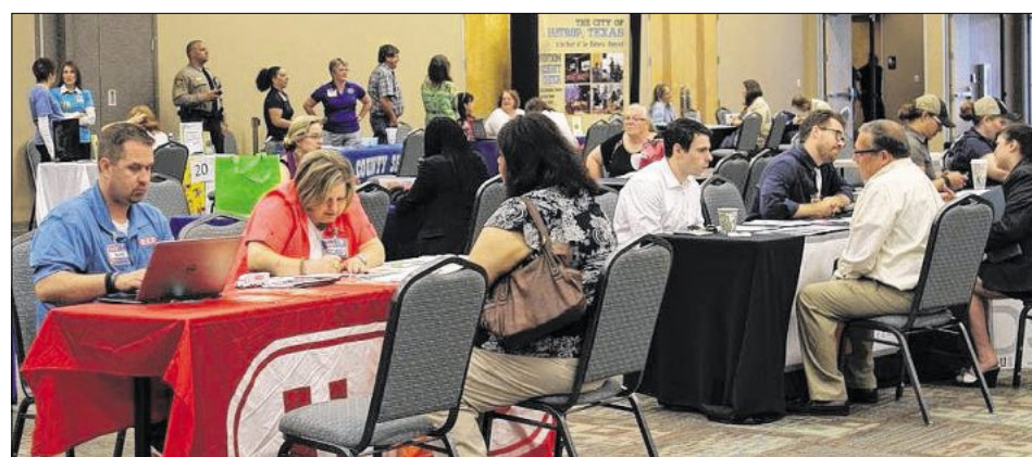
Bastrop Career Fair: The Bastrop Career and Job Fair on May 9 was set up for adult job-seekers, with more than 300 people attending looking for a job or new career. At press time, at least 38 people had been hired from this event.