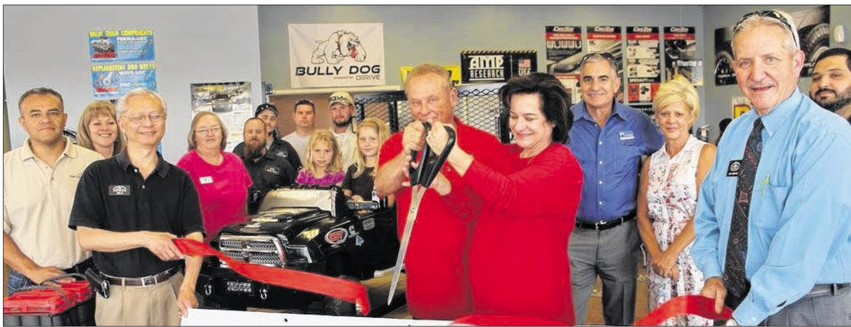
CentX Trailer & Repairs and CentX Custom Truck had their Grand Opening on May 1 with the Chamber Staff and Ambassadors. They are located at 104 Enchanted Cove in Cedar Creek. Contact them for all your truck and trailer needs.