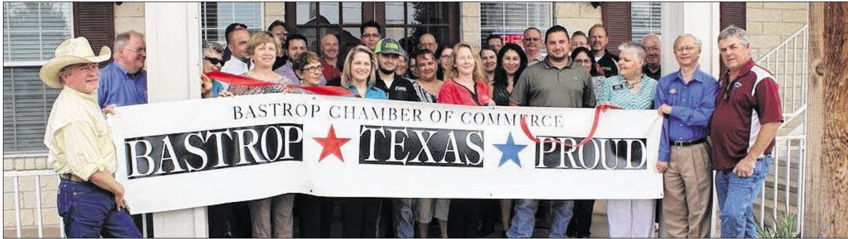
J. Irwin Co. has relocated its operations to Bastrop and is located at 111 N. Hasler Blvd. #200. The company's Grand Opening was held on April 22 with Chamber Staff and Ambassadors in attendance. Another sign of a growing economy in Bastrop!