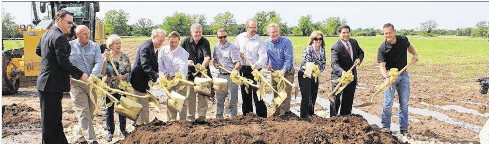
Pecan Park Development is the newest planned housing development to come to Bastrop. A ground breaking was held on April 20 with the Chamber, Bastrop EDC and City of Bastrop. Eventually there will be 550 lots with two different homebuilders for the growing housing needs of our community.