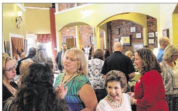
BEST Mixer: The B.E.S.T. Countywide Mixer was held May 14 at Baxters on Main. More than 100 chamber members came together to celebrate the partnerships among Bastrop, Elgin and Smithville.