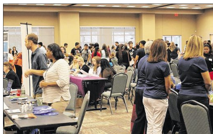
Student Day at Bastrop Career Fair: The first Bastrop Career and Job Fair was held on May 8 and 9 at the Bastrop Convention Center. Friday was geared toward 11th- and 12th-grade students, giving them the opportunity to find summer jobs and explore career options after high school.